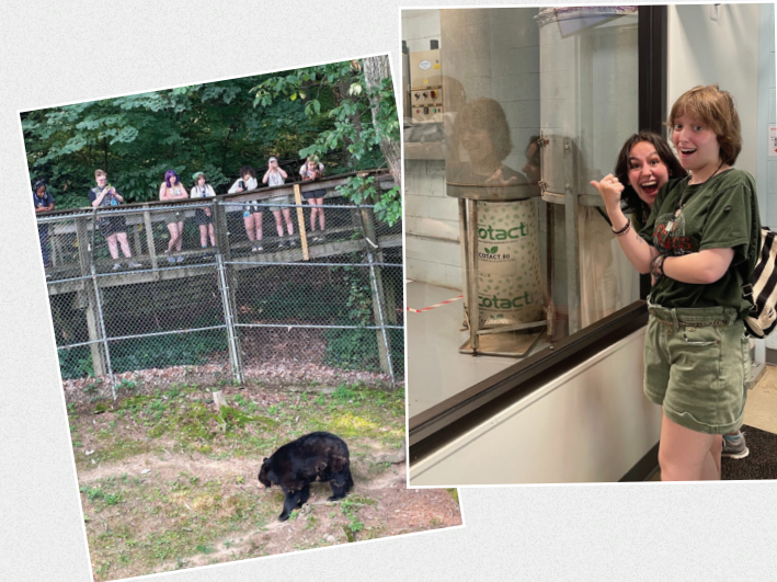
Pre-orientation students tour behind-the-scenes at the chocolate factory and visit the local wildlife at the WNC Nature Center.