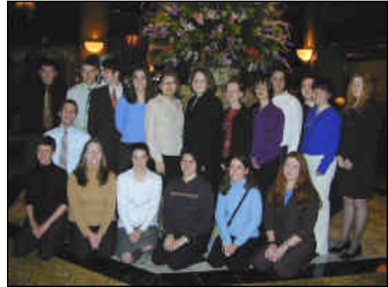
At the Peabody Hotel before boarding the bus for school visits in Memphis.