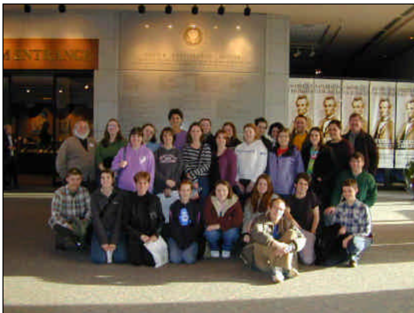
Group photo at the Carter Presidential Center in Atlanta.