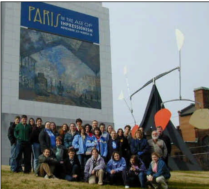
Group photo in front of the High Museum of Art in Atlanta

The next day's destination was Atlanta, where the group toured the Carter Presidential Center to learn about the nation's many presidents through films and exhibits. The most popular display featured Jimmy Carter's recently won Nobel Peace Prize. The Broadway production of Stomp at The Fox Theatre that night rounded out the day's cultural activities. Before heading back to Asheville on January 12, the group toured the High Museum of Art, which featured special exhibits of African-American Art and works of the French Impressionists. (For more photos, see p. 5)