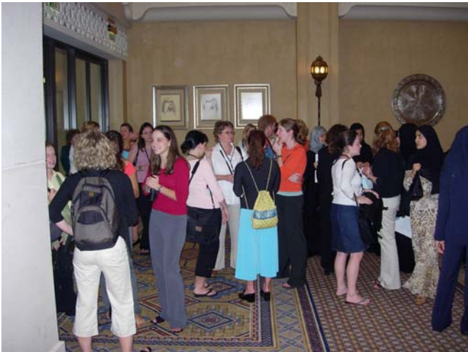
Student mingle between sessions at the 2006 “Woman as Global Leaders” conference.