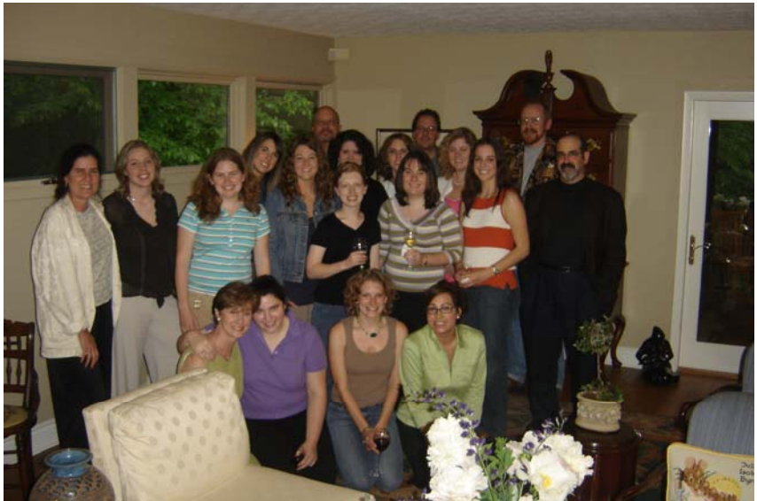
Entering Class of 2002 along with several UNCA Faculty guests