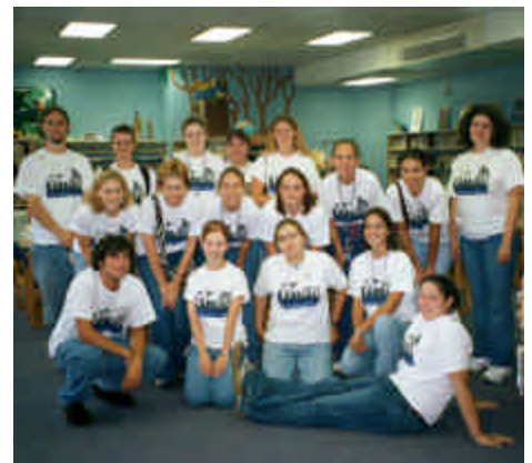
2002 Freshman Teaching Fellows