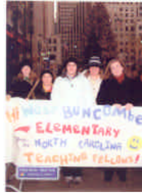
Teaching Fellows on the Today