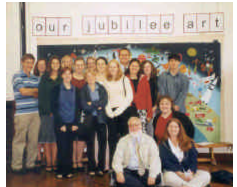
Cambridge 2002 group at British school.